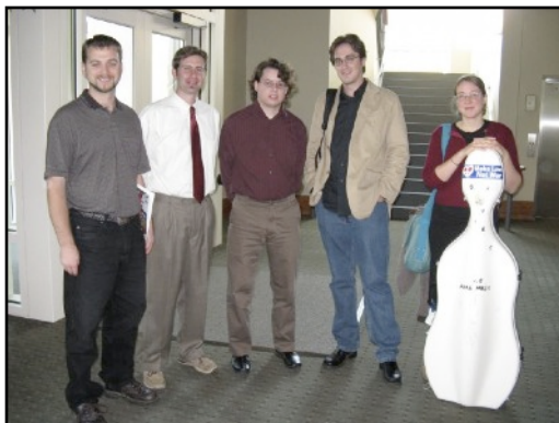
SCI Student Composers and Conference Performers